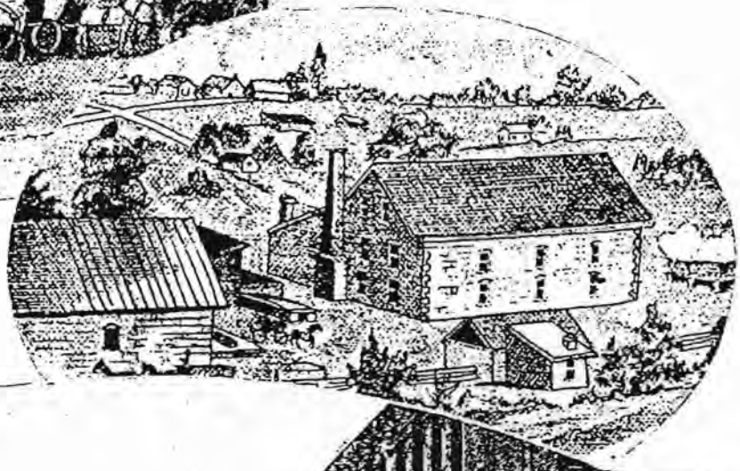
Right—Shreveport's first hostelry, Catfish Hotel, 1837.