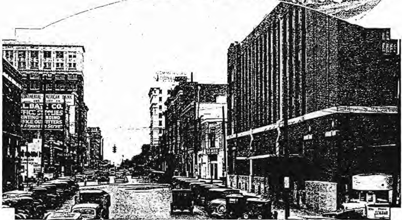
MARKET STREET, LOOKING NORTH, 1935

The "Catfish Hotel," the first primitive hostelry of early Shreveport days, is shown in the above group as it stood in 1837. The village of Shreveport, as it existed in 1836, before it was dignified with that name, is also shown.