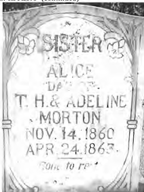
Alice Morton marker