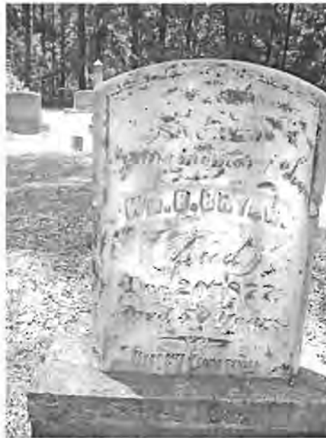
Wm B. Bryan marker