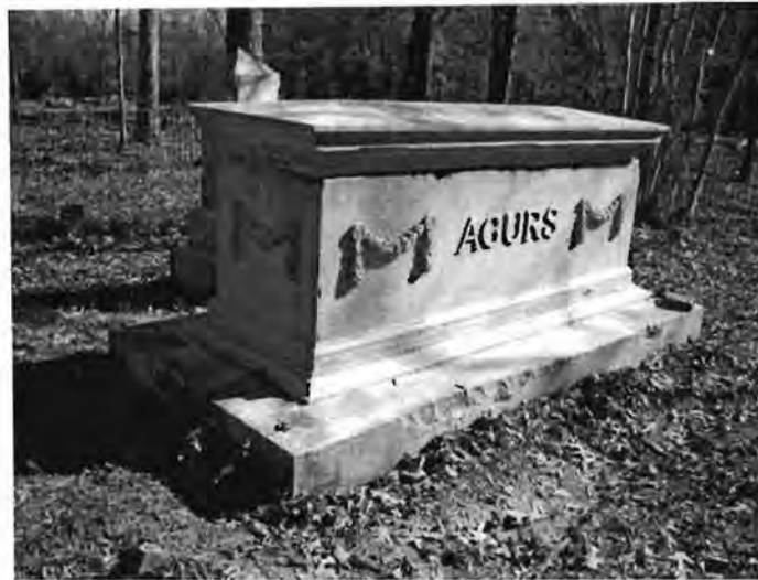
ARGUS - Tomb marker