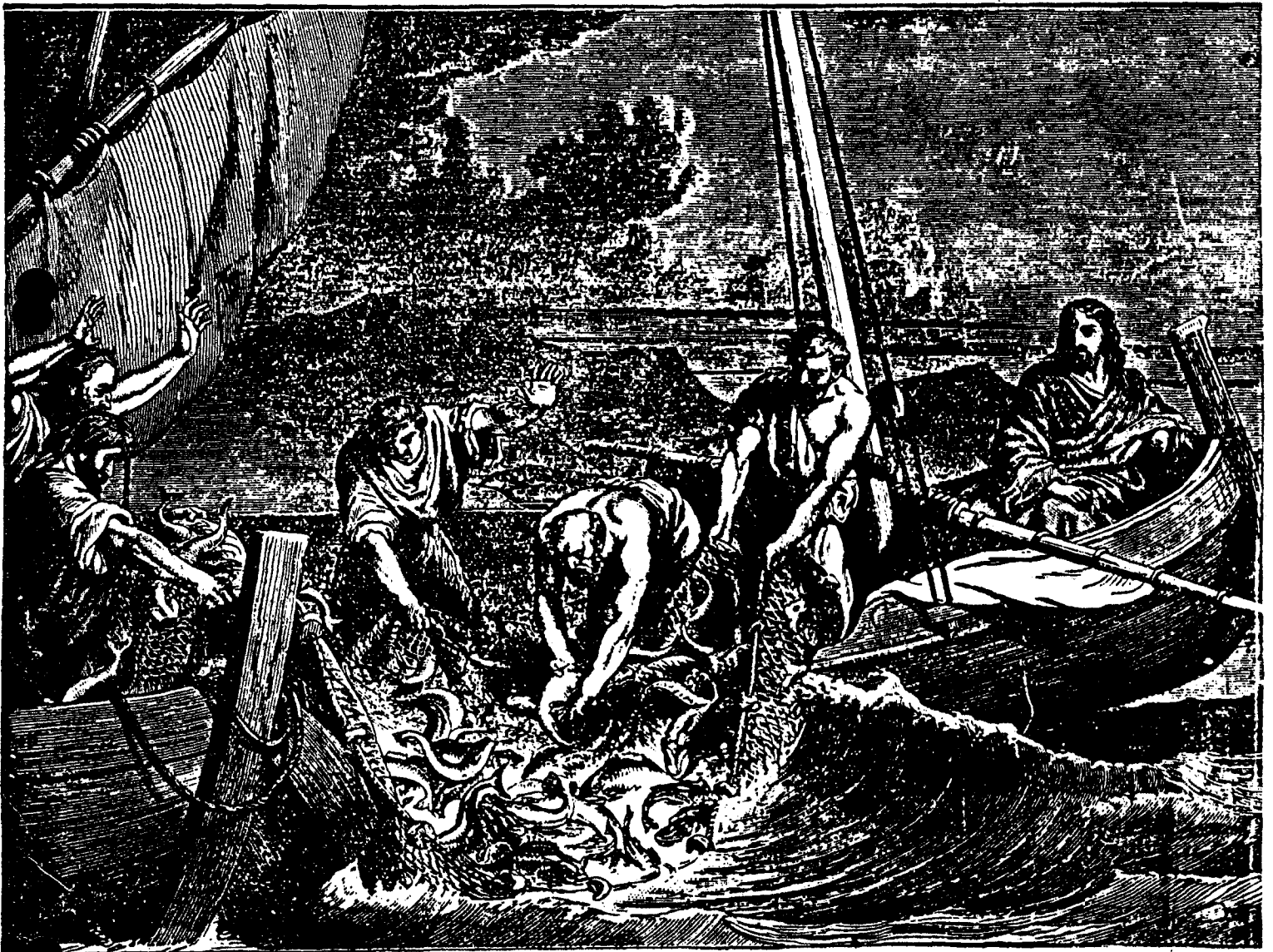
THE MIRACULOUS DRAUGHT OF FISHES.—Luke v. 6.