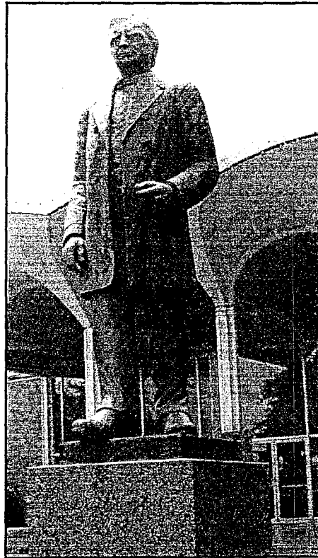
Statue of Capt Henry M. Shreve on Shreveport Waterfront