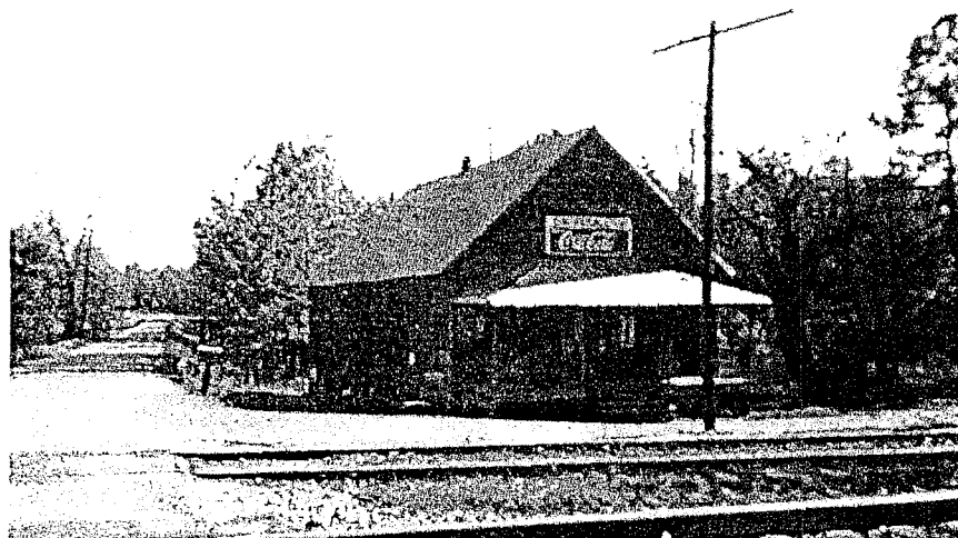
Photo of S. M. McCall's store at Hughes Spur, LA (incorrectly identified as Rocky Mount) January 1958